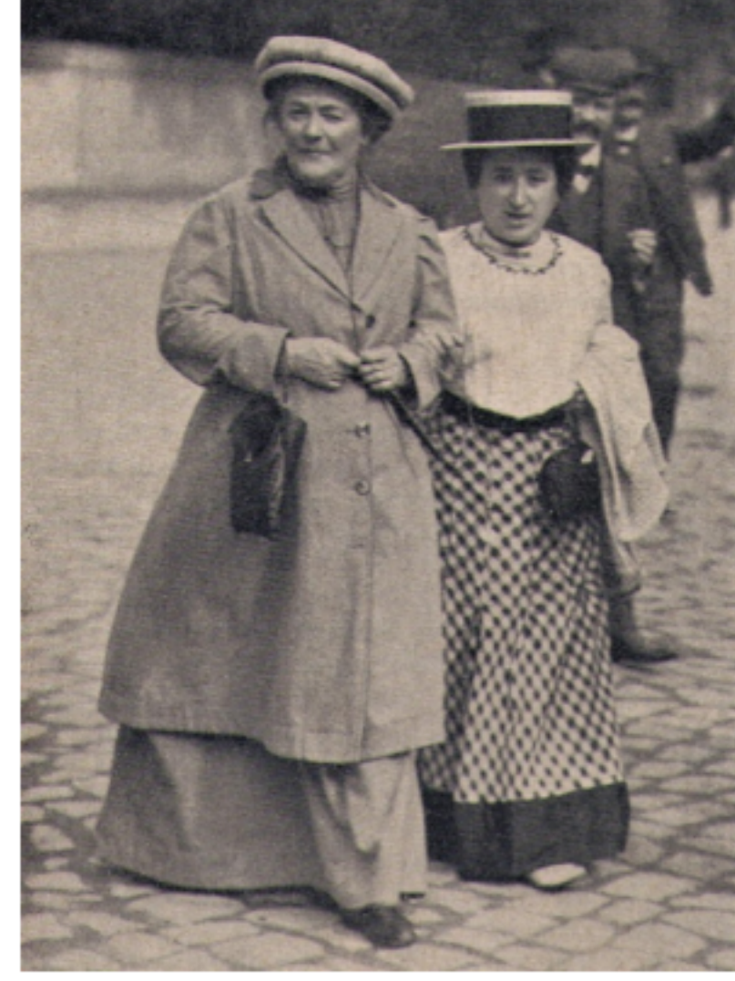
Photo: Clara Zetkin and Rosa Luxemburg, early women's rights activists, marching at a demonstration, arm in arm.